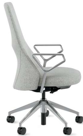
Mid-Back Loop Arm 5-Star Base