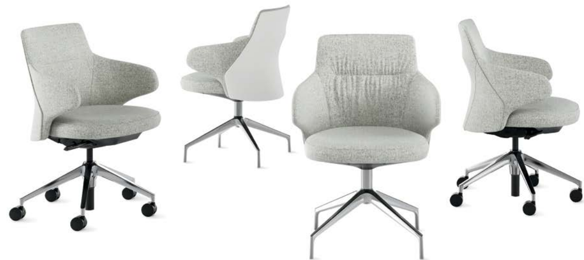
Low-Back Conference Chairs Integrated Arm

Created in collaboration between the Coalesse Design Group and Jean-Marie Massaud, this is a chair that adds fact to form. Every detail is driven by advanced engineering to assure optimised comfort from the inside out. Our science shapes a better chair to support productivity and generously fit the body.