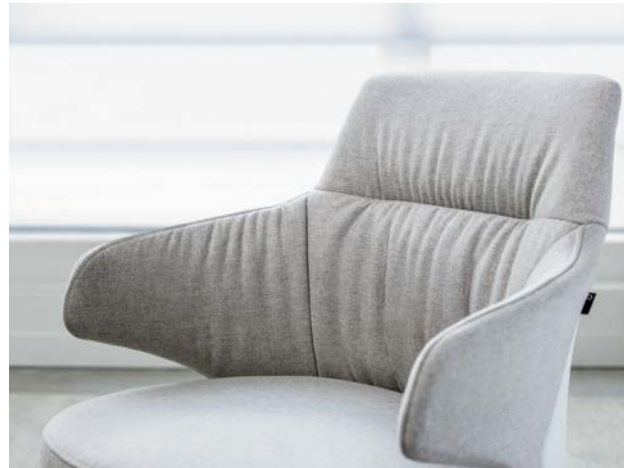
————— Duvet conference chair. Plush and quilted upholstery for a softer, casual look.

Personal by design, for the perfect fit every time. Two refined upholstery techniques allow for many tailorable expressions, in crisply fitted or soft duvet styles. With mid or low backs, up to three fabrics, and a choice of arms and bases, you can mix and remix to customise each chair from a range of standard seating options to meet in your own style.