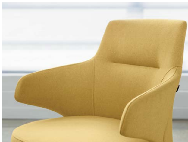
————— Conference chair. Firm and tailored upholstery for a more formal expression.