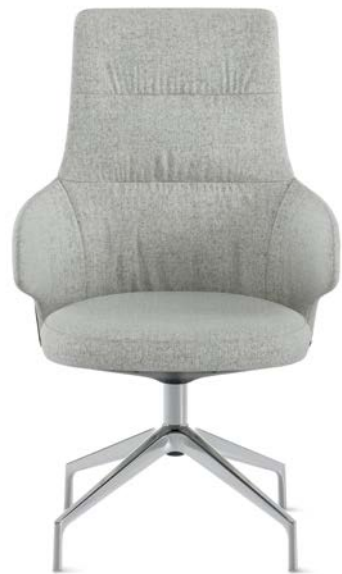
Mid-Back Duvet Integrated Arm 4-Star Base

Massaud Conference Seating brings forward-thinking design and applied seating science to the diverse places where people meet. Sculpted in form, engineered for comfort, and crafted with precision, this chair is a modern classic that you can tailor to fit your style of work.