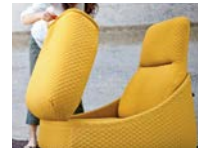
FLIP LOUNGE CONVERSION