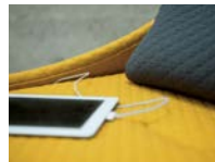
CABLE PASS THROUGH